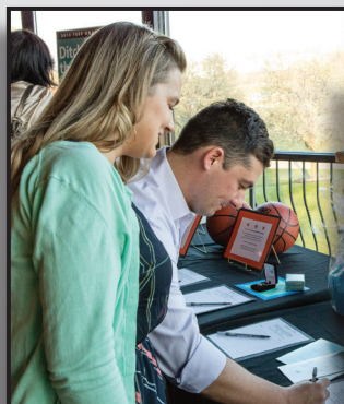
Celebration of Excellence, Silent Auction