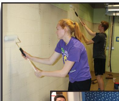
Above: Working hard at the closet builds

The YSEF Alumni Committee continued connecting with YSSD alumni and retirees to foster their continued support of the district. Over 50 alumni attended the YSEF Alumni Event in October and raised $900. See back page for how else alumni and retirees are supporting YS education.