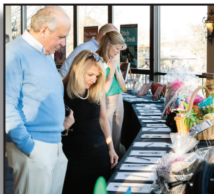
Celebration of Excellence event at Heritage Hills

YSEF can help organize your class effort, and keep you updated on alumni events and YS happenings. Send us a message by visiting www.ysef.org to update your contact information and LIKE York Suburban Education Foundation on Facebook.