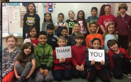
THANK YOU for supporting YS students!