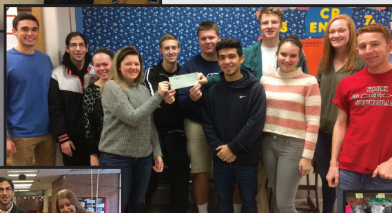
Below: Impact Closet collection drive at YSMS