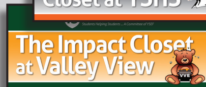
Above: Closet needs are regularly posted on YSEF's FB page—LIKE us and look for images like these to help!