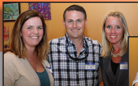
Alumni Event at the Holy Hound Taproom

WANT TO HELP? Visit our website at www.ysef.org and like us on Facebook to see details about upcoming events, pictures of the grants in action, purchase Tribute Cards for teachers, and make an online donation.